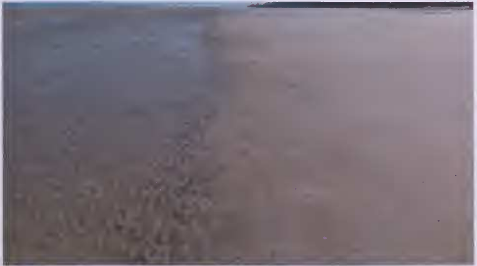
Figure 1. Wulguru cuspidata inhabits water-filled wave-formed runnels on open sandy beaches north of Darwin. This photograph shows the habitat near the mouth of Sandy Creek at Casuarina Beach with the transition between the runnels on the innermost mid-tidal sand flats (to the left of centre) to the smooth sloping high-tidal beach (to the right of centre). The direction of view is due north, 24 October 2014. (Neil Wright)

All four authors continued to observe the acoels throughout the dry season, the 'build-up' and the early wet season of 2014, up to the first bout of the north-westerly monsoon in January 2015. We expected the populations would vanish sometime during this period when the air or water temperature increased, or when the annual bloom of Trichodesmium cyanobacteria choked the intertidal zone, or when the puddles became filled with the annual die-off of Sargassum sp. seaweed, or when the salinity fell to almost zero after bursts of heavy rain, or when the monsoon set in. But they persisted throughout all these environmental 'catastrophes'.